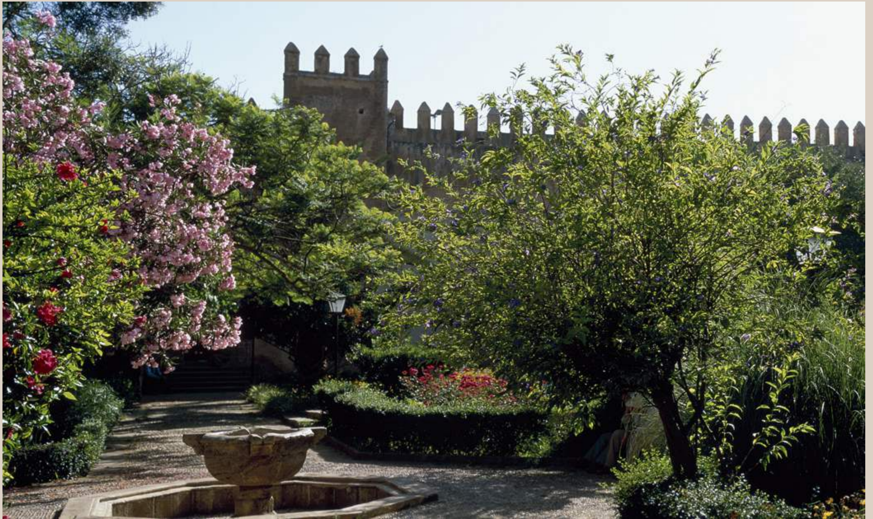
The Andalusian garden and the Oudaya Kasbah