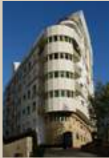
A new town fully equipped with modern infrastructures