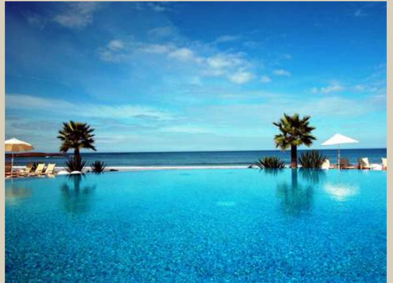
Hotel infrastructures at Skhirat beach