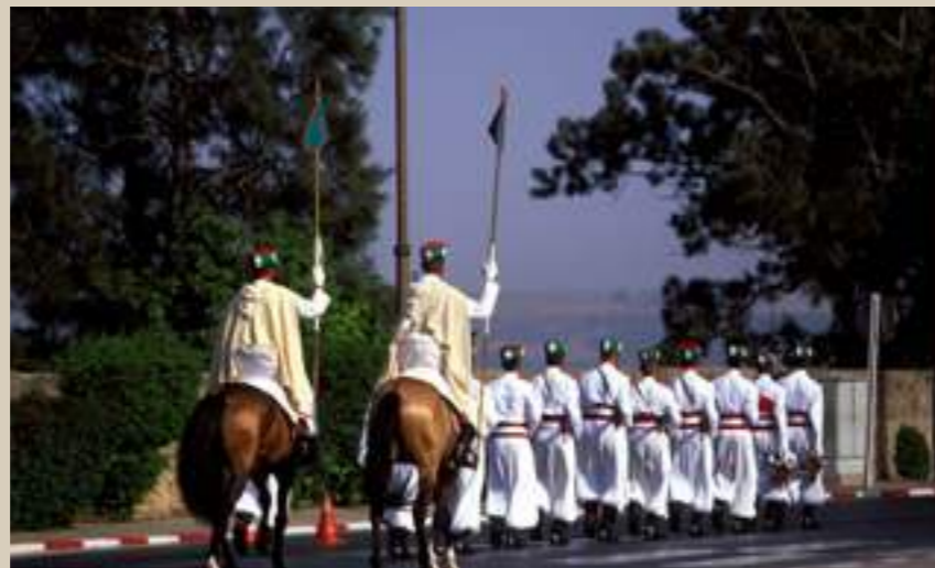
Changing of the Royal Guard

The wall that surrounds the old town is entered through 5 monumental stone gateways (Bab el Alou, Bab el Had, Bab Essoufara, Bab er-Rouah and Bab Zaërs). The largest of these Almohad creations is Bab er-Rouah, its monumental sculpted stone facade standing between two projecting towers. Its inner rooms have been res-