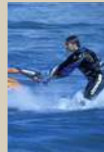
"Rabat Jet Cup" national jetskiing championship

Rabat is also a top-quality well-being destination. The city abounds in hammams, traditional and modern alike. These "Moorish baths" comprise a series of steam rooms at different temperatures and dispense a whole range of massages and body and beauty treatments. In addition, the last few years have seen the appearance of numbers of magnificent spas, combining all the benefits of water, traditional beauty care treatments, and the latest techniques to get you back on tip-top form.