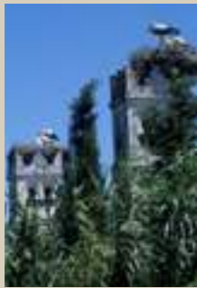
Rabat, a stork's paradise

Rabat has taken care to expand and develop harmoniously. Architectural rigour is apparent everywhere – wide tree- and flower-lined boulevards, building rarely more than five storeys high, and administrative and residential districts where tranquillity reigns supreme. The “city of flowers”, as Marshal Lyautey liked to call it, is also an authentic Moroccan city, the very opposite of a capital without a soul. If you need convincing, just make your way through the little streets of its medina and the major roads through the new town.