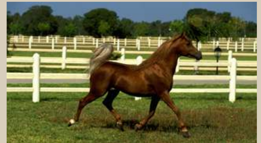
Each year, Rabat hosts the "Week of the Horse" at Dar Essalam Royal Polo Club