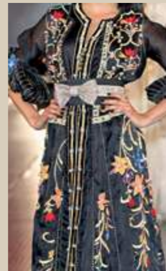
The delicate touch of Rbati embroiderers