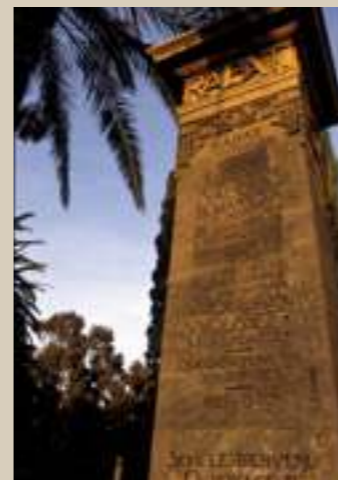
The pillar in Avenue de la Victoire, bearing the inscription "Sois le bienvenue au voyageur" ("Welcome, traveller")

Yacoub El Mansour died before he finished his work, and the city lost something of its allure. The world's largest mosque, the Hassan Tower, was never to be completed. The end of the Almohad dynasty hastened the city's decline.