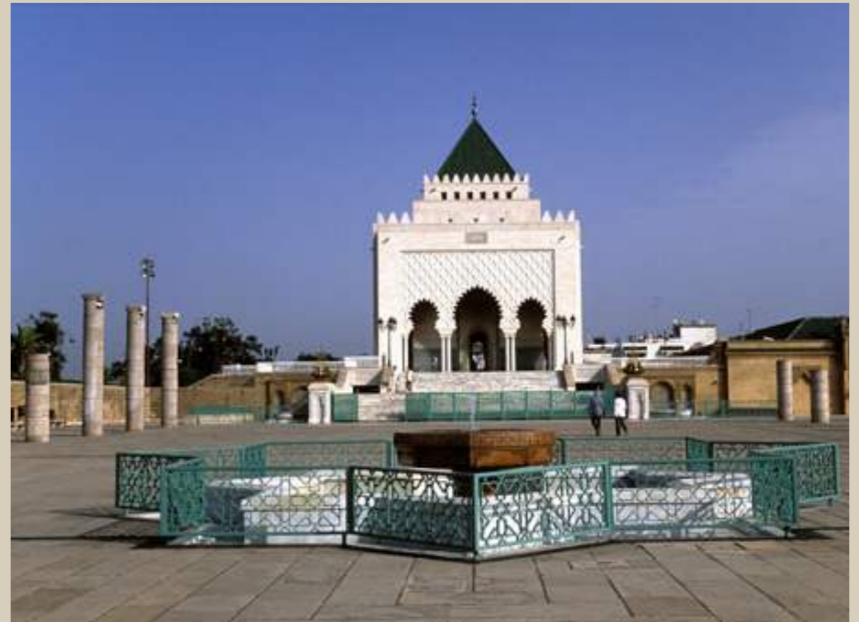
Mohammed V Mausoleum esplanade

The Chellah is located about 2 km from the city centre and is made up of the necropolis itself and the ancient city of Sala. The ruins, with their omnipresent birdlife, nesting storks and wild vegetation, must be one of Rabat's most arresting features. Protected by an imposing surrounding wall and accessed through a monumental gateway, the necropolis is an oasis of tranquillity, a peaceful flower-