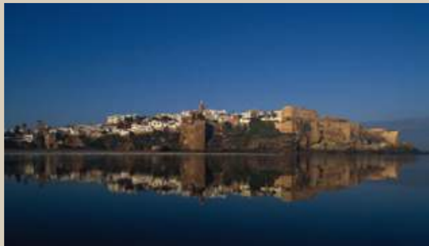
View over the Oudaya Kasbah

In the late 12th century, the powerful Almohad sovereign Yacoub El Mansour built the Hassan Tower in the image of the Koutoubia in Marrakech and the Giralda in Seville, and fortified the kasbah, surrounding it with two towering walls entered through five gateways.