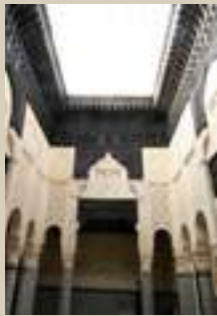
Arabo-Andalusian architecture: the medersa Bou Inania in Salé