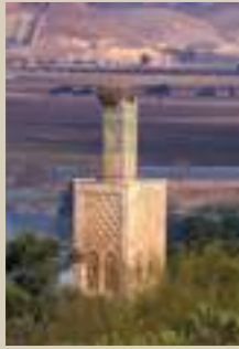
Minaret of the Chellah mosque overlooking the mouth of the river