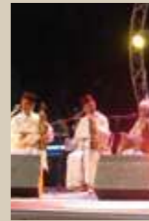
"Al Ala", Andalusian music from Rabat

Since its creation in 2001, the prestigious "Mawazine Rhythms of the World" Festival, which is held in May, has taken its place among the world's greatest music festivals. Every year, artists from over 40 countries in all four corners of the world perform in a programme of concerts lasting over a week and presented in a variety of venues in the city. Every evening, over 80,000 people come to applaud such great names as Stevie Wonder, George Benson, Alicia Keys, Bilal and Aldi Méola, well and truly making the city the capital of world music!