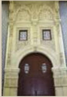
A door typical of the Rabat medina

From Traditional crafts to ultra-modern shopping malls, via stores selling international luxury brand names, Rabat provides a thousand and one ways to go shopping.