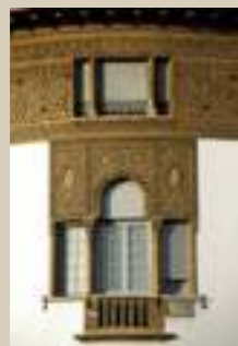
Architecture from the days of the Protectorate

It takes its name from the Muslims who were chased out of Spain in 1609-1610. Passing through the Andalusian wall, you find yourself in rue Souiqa, between two rows of shops selling traditional craftwork. Rue Souk-es-Sebat is an extension of rue Souiqa and is a district of dealers in fine leather goods, fabric sellers and bazaars. Along with these two streets, rue des Consuls is the busiest in the medina. It is lined with craftsmen's workshops and fabric and carpet-sellers' stalls, and on Thursday mornings, you can witness the Rbati carpet auction. Narrow little alleyways have the habit of opening out on to squares specialising in leather goods, ironware and woven fabrics – markets within the market. In such hidden islets of activity, the craftspeople work according to traditional methods, and the atmosphere is always warm and welcoming.