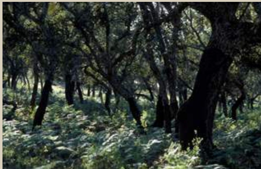
The Mamora Forest

Cork oaks and Eucalyptus flourish in the Mamora Forest north of Rabat a