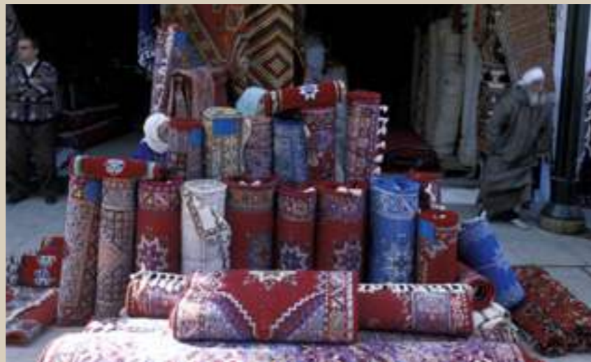
The Rbati carpet auction

This is an "urban" carpet, in contrast to the rural carpets woven in the Atlas Mountains. Fine in texture, with short-pile wool and often red in colour, the centre is decorated with a lozenge scattered with floral motifs. A knot carpet made by women, the Rabat variety has gained a reputation equalling that of Oriental carpets. There are close to 6000 weaving looms in operation in the region, either in craftwork cooperatives or in the hands of individual producers.