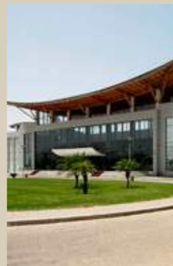
Palais des Congrès, Skhirat

Finally, the Corniche running along Rabat's Atlantic coast has much to offer to attract visitors. Prestigious hotels, fine residences and business towers will soon be changing the face of the city, and other leisure facilities are planned for to meet your every expectation, including a major shopping mall, cinemas, fitness clubs and a water theme-park. The new Corniche will be the administrative capital of a tourist destination without parallel.