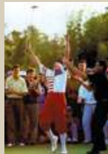
The Hassan II Golf Trophy

Rabat's Dar Es Salam Royal Golf Club has become a legend among golf enthusiasts everywhere. It is here that the world famous Hassan II Trophy is held. The majestic course was designed by Robert Trent Jones and inaugurated in 1971, its splendid fairways making their way among eucalyptus, palm trees, hyacinths, narcissi, mimosas, papyrus and Roman columns. All along the course, colours and aromas mingle to create a truly unique playing experience. Open all year round, the Dar Es Salam Royal Golf Club has three different circuits on offer, ensuring that amateurs and professionals alike can enjoy playing to the best of their ability. With its legendary and altogether magical course, Rabat's Royal Golf Club has gained international recognition as part of the European Tour, one of the two most prestigious professional golf tours in the world.