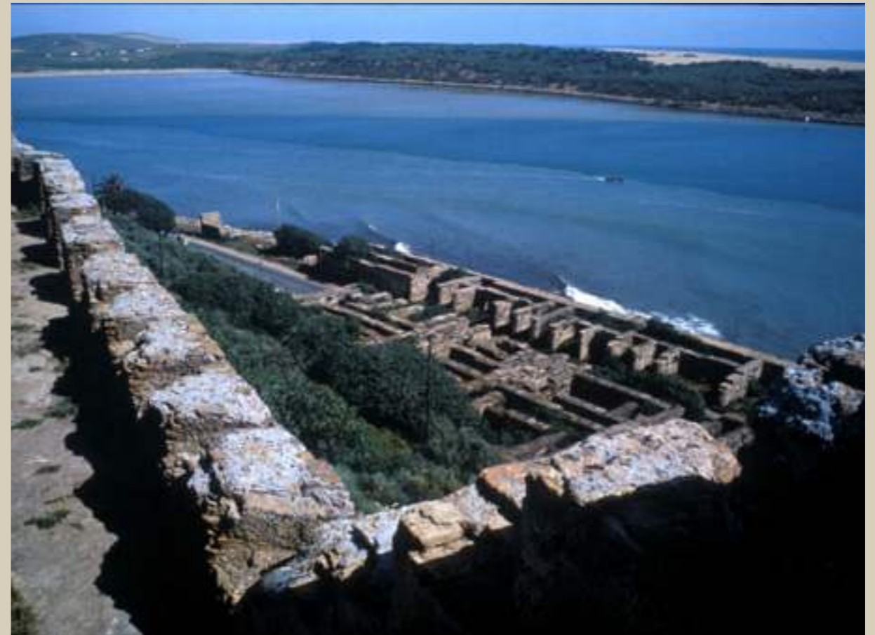
View over the Sidi Boughaba Reserve

Every year on the eve of Mawlid (the Prophet's birthday), Salé dons its finest attire for the candle procession. Decorated floats parade through the city streets bearing the thirteen candles originally carried by the gondoliers who once ferried people back and forth across the Bouregreg. The procession has been organised for the last four centuries by a renowned religious brother hood, the Zaouia El Hassounia.