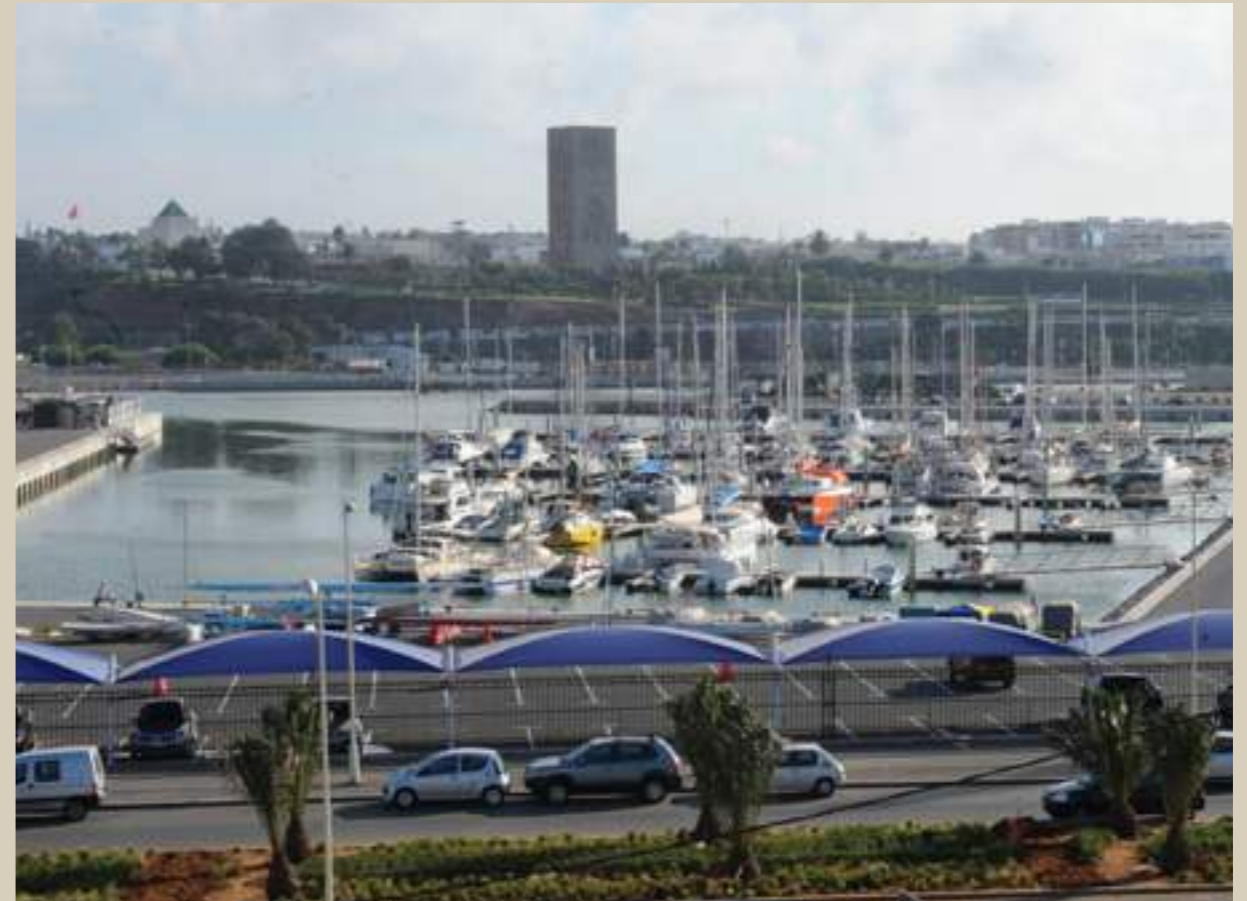
The Bou Regreg marina