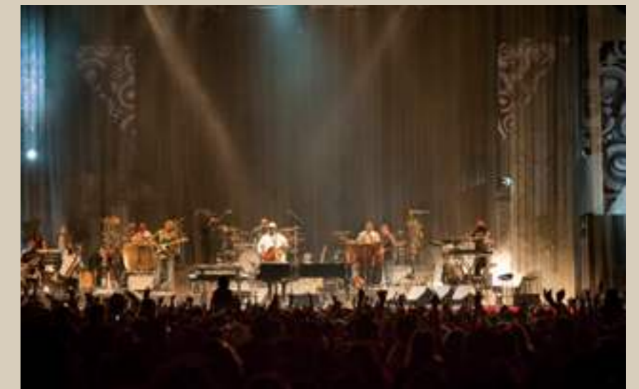
Mawazine, world music festival

A true poetic art, malhoune is perhaps better known nowadays by the name of "quassida du ghazal". Originating in the Tafilalet region and the zaouias, it has been influenced over the centuries by the rhythms of Andalusian music and popular songs, which gave birth to the "quassida".