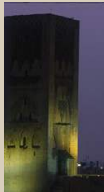
The Hassan Tower

filled garden containing an ablutions room, a zaouia with an oratory, the zellij-adorned Merinid minaret, and a series of burial rooms.