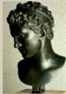
Bust of Juba on exhibition at the Rabat archaeological museum

A star player in the Kingdom's artistic and cultural life, Rabat is home to a dozen or so international cultural institutes, a wide variety of museums (including the archaeological museum, ceramics museum, Oudaya museum, Barid Almaghrib museum, numismatics museum and the Belghazi ethnographic museum) and the legendary Mohammed V National Theatre, which lends effective support to the pursuance of the dramatic arts in Morocco. The National Library meets the needs of scientific research and is active in the conservation of the Kingdom's documentary heritage, an essential part of its collective memory.