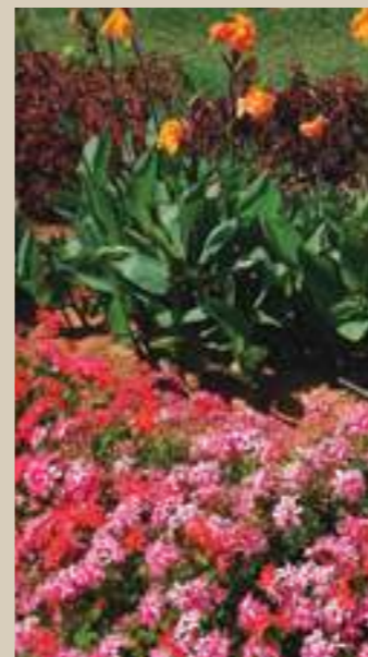
The Bouknadel Gardens