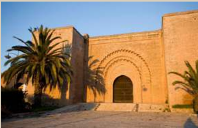
Doorway of the Bab Rouah gallery

The city's archaeological museum conserves collections unearthed from digs carried out on sites throughout Morocco. Its major exhibits include bronzes found in Volubilis, Lixus and Banasa, geometrical mosaics from