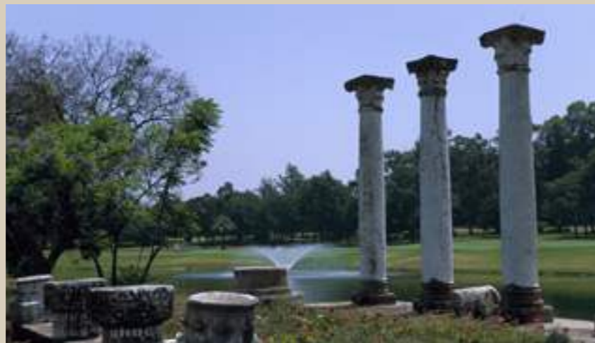
The Dar Essalam Royal Golf Club

The Trophy goes side by side with a tournament for women players, the Princess Lalla Meryem Cup , which is a stage in the Ladies European Tour. The Hassan II Trophy and the Lalla Meryem Cup keep their separate identities as they are included in professional competitions. Encounters between amateur golfers, such as the Friendship Cup during which celebrities play celebrities, are always organised alongside official competitions.