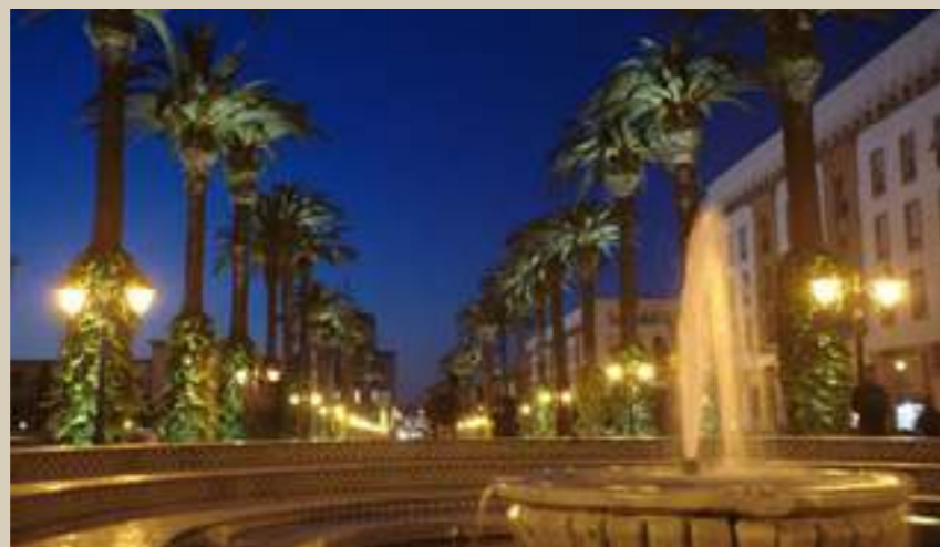
Avenue Mohammed V