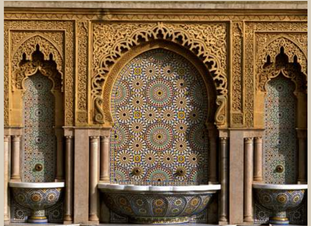
Mohammed V Mausoleum fountain