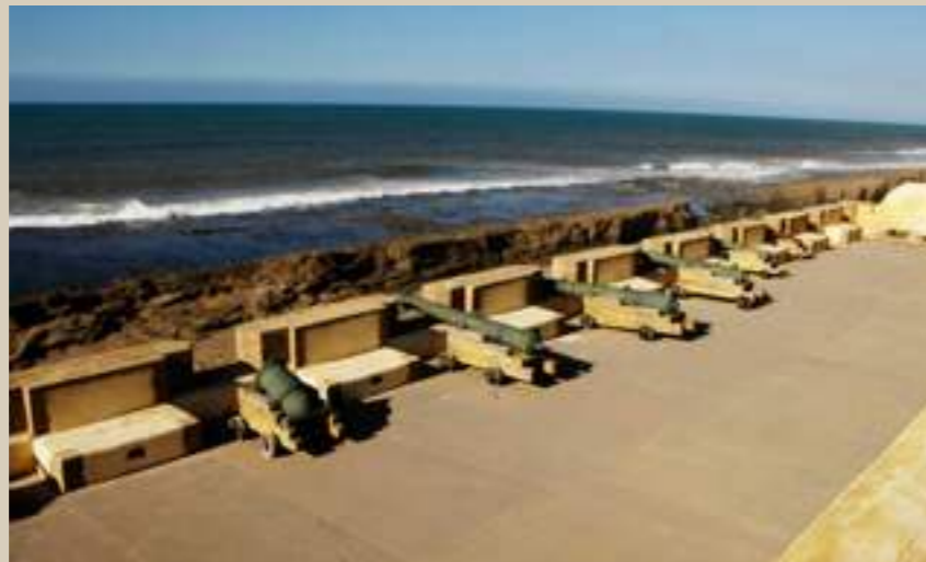
The cannons of Borj "Addomoo", Salé

From Souk Al-Ghazel square, the auction market, to Souk El-Merzouk, which specialises in jewellery, visitors wander from stall to stall in wonder. On the city's heights stand the great mosque and the Salé medersa. The mosque was originally built in the 11th century, and was renovated and enlarged in 1196 by Sultan Yacoub El Mansour, who provided it with a majestic minaret and a monumental doorway decorated with foiled arches sculpted from Salé stone. The for-