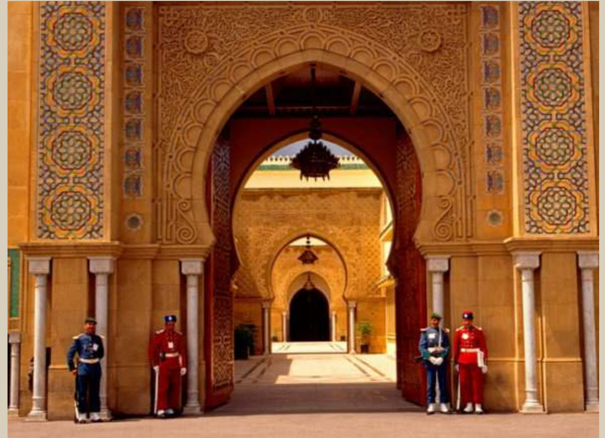
Entrance to the royal palace