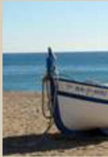
A fishing boat on Skhirat beach