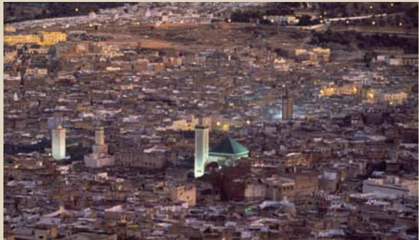
The Medina of Fez: A view of a city no one suspects the feverish activity