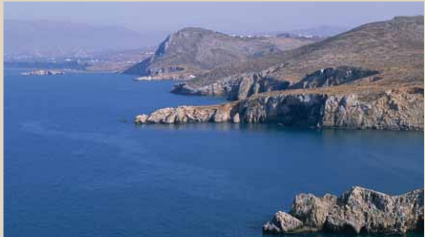
The mediterranean coast

and the future jewel of the Mediterranean coast. Saidia is becoming a tourist attraction in the heart of Eastern Moroccan, two or three hours from the major European cities by two international airports, Oujda and Nador. With a marina worthy of a boating destination equipped to international standards and considered to be the third largest marina in the Mediterranean. The city boasts of 4 and 5 star hotels, villas and luxury residential apartments, three golf courses and a «Medina Center» with many shops, restaurants and cafes. Close to Saidia, the small fishing village of Ras el Maa is not without charm. Small eucalyptus covered dunes dot the landscape, with a well protected beach backed to a cliff and a site of biological interest at the mouth of the Moulouya.