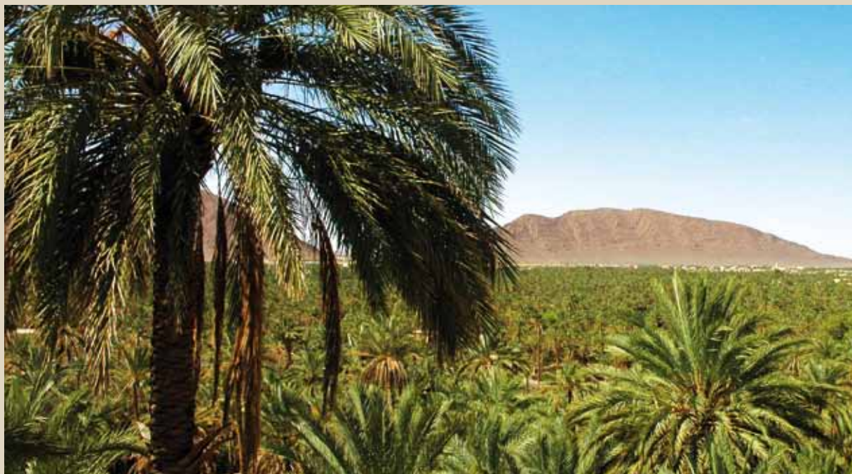
The oasis of Figuig