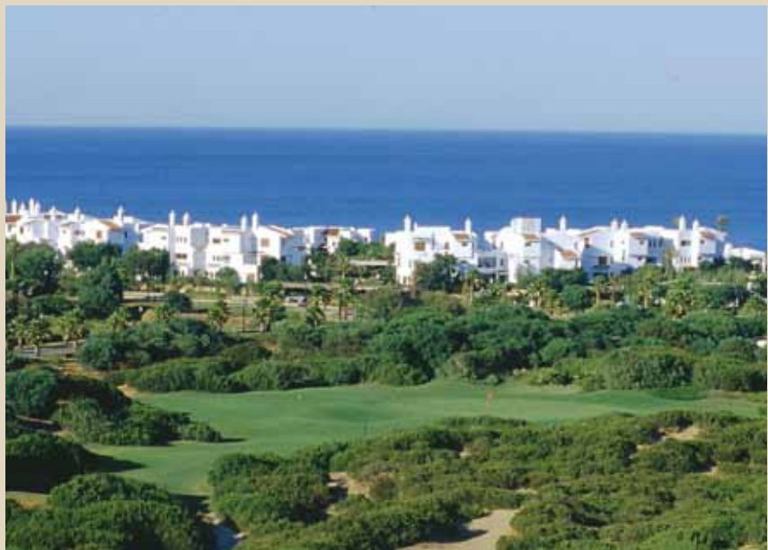
Golf of Cabo Negro