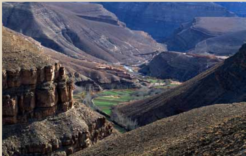
The Dades Valley

On the ancient road of the thousand Kasbah, you will discover the valleys of the Deep South and the wonders of the Berber tradition. Called the casbahs road, the valley is dotted with the majestic and typical citadels, meandering blithely along crop fields and colorful gardens. Almond trees, fig trees, olive trees and silver poplars line the Dades Valley, against a peaceful background of greenery. As you get closer to the foothills of the Atlas, the gorges of the Dades become steep and go enter through high cliffs, daunting waterfalls, and endless streams where you come across friendly Berber tribes. Ksours, adobe citadels, fortified villages and community granaries punctuate this wonderful journey.