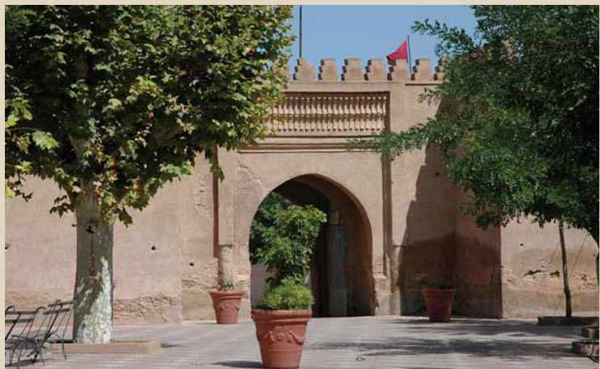
Bab Al Gharbi in the medina of Oujda