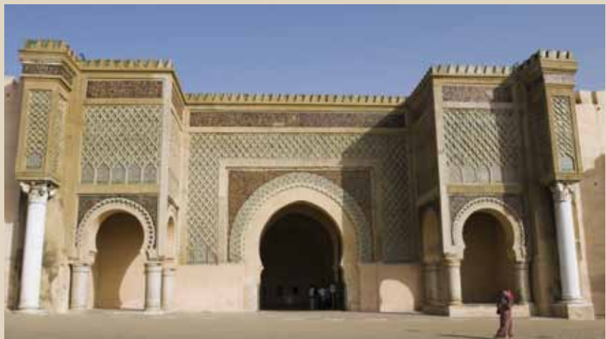
Bab El Mansour

The Moulay Ismail mausoleum, built in 1703, is one of the few religious buildings open to non-Muslims.