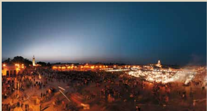
Square Jemaa El Fna