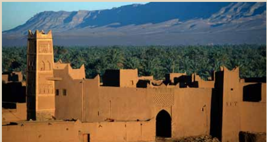
The Draa Valley

5 km from Tamegroute on the outskirts of Tinfou, the first dunes of the desert appear. There are few vehicles and shepherds give way to nomad people. Here, with large and undisturbed dunes, time stops, and pristine scenery stretches as far as the eye can see. Further away, when reaching the village of El Ghizlane M'hamid, the feeling of touching the end of the world is overwhelming. The desert province is surrounded by sand ergs of breathtaking beauty... Camels, Berber tents, bivouacs and sand baths await adventure lovers.