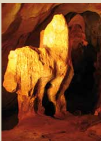
The cave of the Camel