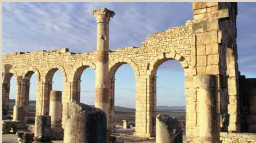
The Arch of Triumph, Volubilis

Skiers should not miss the slopes of nearby stations, Michlifen (2036m) and Jbel Heb (2104m).