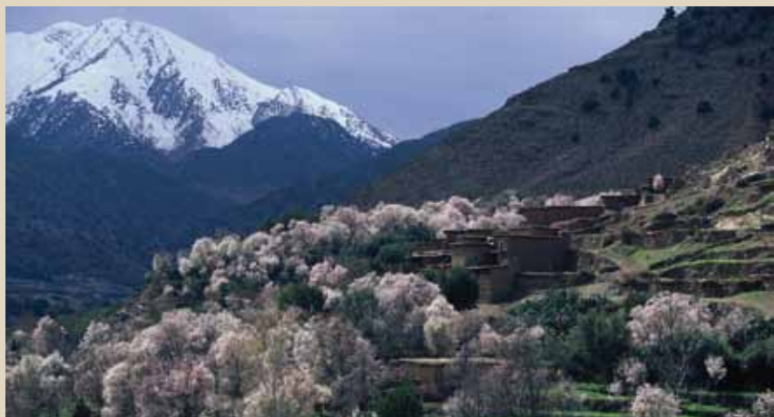
Berber village in Ourika valley

We can also go fishing on the lake of Bin el Ouidane, north of Azilal. In Beni Mellal you can go paragliding, jump with a parachute or ride an ultralight aircraft and fly over the valleys of the Atlas.