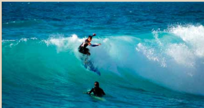
Bodyboarding, surfing, windsurfing, funboard: all sports are practiced in heavenly spots along Morocco's southern coast

On the Mediterranean, all sailing lovers can take to the sea: light boats, long cruise, fishing trips aboard sailboats and catamarans. The Mediterranean in Morocco enjoys a moderate and constant prevailing wind, a moderately rough sea and at the right temperature, and a pleasant climate that encourages all water activities and sports. Scuba diving in crystal clear waters reveals the seabed flora and fauna in the southern coast of the Mediterranean. The absence of strong current, the diversity of diving spots and the equipment available on site, they all make the Mediterranean one of the most interesting spots for divers of all levels. In addition, places and equipment are specifically made available to all fans to create the ideal conditions for fishing.