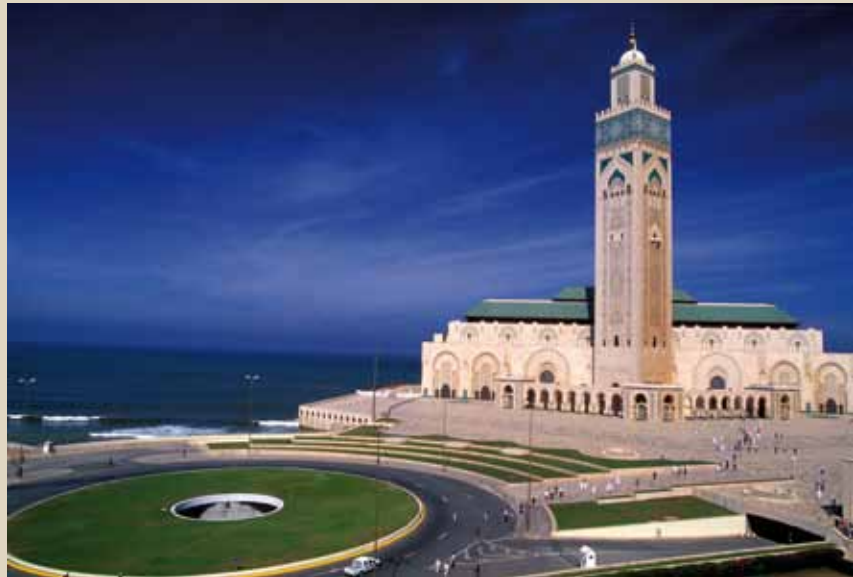
The Hassan II Mosque

Even when constantly changing, Casablanca still retains a rough charm. From the church of the Sacré Coeur to the central market, between alleys, passages and boulevards, the city perpetuates the avant-garde architectural mastery skills specific to the 20s and 30s. An architecture combining urban planning and aesthetics, found all around the centers of power. Admire the Art Deco buildings with their domes, columns and carved balconies glorifying an era that was the scene of unique architectural expressions. A mixture of neo-Moorish style and art deco geometric shapes, punctuated by zellige and neoclassical expressions, is creating at every street corner, an eloquent patchwork.