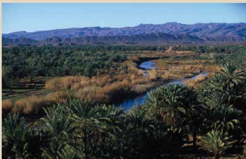
The Ziz valley

In this valley towards Errachidia, the Ziz river finds its way into limestone rocks, between dry red high cliffs. It leads to an incredible stretch of water, fringed by a thin strip of green land, with ochre shade banks where apricot trees are growing. The palm groves follow one another along the river which goes to the south where it feeds the huge Tafilalet palm grove.