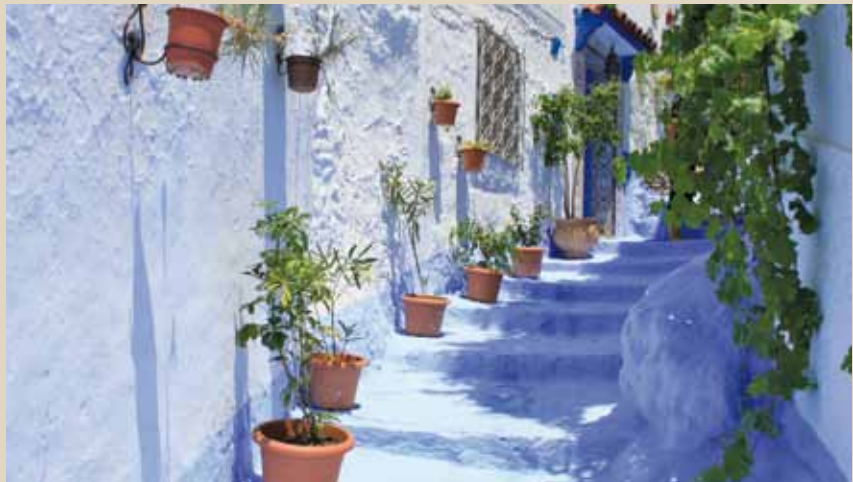
Typical alley Chefchaouen medina

The region of Chefchaouen in Morocco is a leader in terms of environmental commitment and environmental preservation and it offers a variety of stimulating activities combining trekking, hiking, climbing, caving, hunting, fishing and canoeing to discover the fascinating Rif mountains, the pine, cedar and oak forests. This region is one of the first in Morocco to take part in the flagship project «Tourism host land», an initiative which promotes the development of rural areas through routes which bring you in touch with the people and their lifestyle. Talassemtane National Park extends over a breathtaking landscape and contains over 1,380 plant species, including many endemic ones and a rich fauna with more than one hundred species. Near the park, God's Bridge in Akchour, is an impressive natural arch, carved in the red rock, overlooking the crystal clear waters of the Oued Farda. You can also visit Cherifat waterfalls, a place where only the sound of the towering waterfalls breaks the silence.