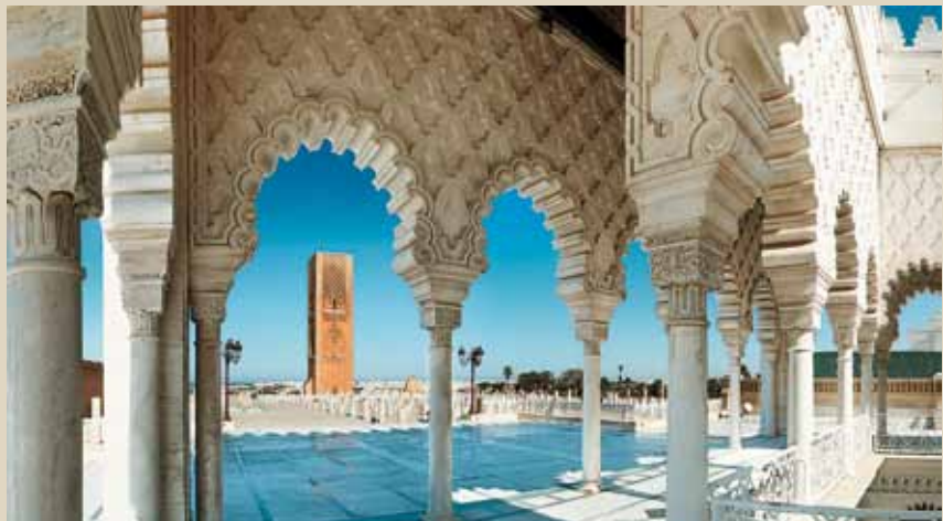
Mohammed V Mausoleum

The Mohamed V Mausoleum is a masterpiece of Moroccan traditional art showing all the skills of Morocco master craftsmen. The Oudayas casbah is filled with a calm atmosphere with its garden and Andalusian Moorish cafe.