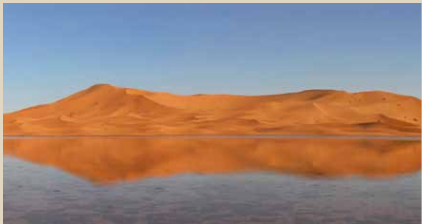
The dunes of Merzouga

Untouched by the constraints of time and space, alone in a silent and pure open land, Merzouga is simply subjugating.