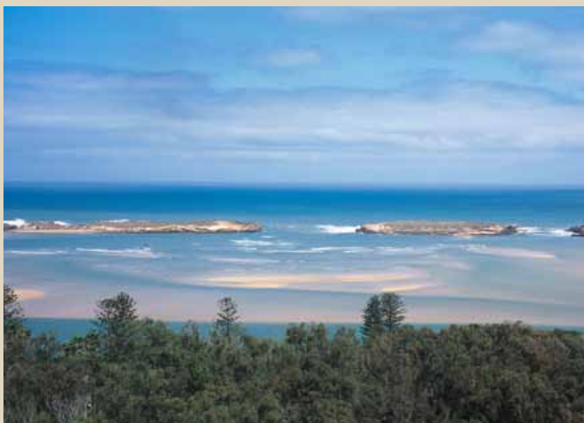
El Oualidia lagoon

Nestled beside a heavenly lagoon, Oualidiya is a haven of peace. You will never forget the taste of those succulent oysters in the parks or in one of the many restaurants lining the beach. Suitable for swimming, sailing and fishing, Oualidia is a charming seaside town you can't afford to ignore.