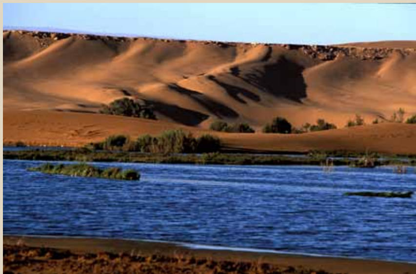
Lagoon near Laayoune

Dakhla is an enclave of a striking beauty. Mysterious, it is a unique peninsula. The city hosts a great annual cultural and sport festival in February between sea, sky and desert. Dakhla is the kingdom of board sports where many tourists and locals get carried away by its massive waves. Something which makes it stand as the undisputed queen of the wave.