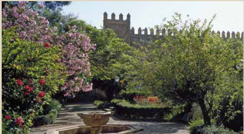
The Andalusian garden of Oudayas casbah

From the souk Al-Ghazal, the auction market, to the souk El-Merzouk dedicated to jewelers, you wander delightfully through the stalls. On the city heights is the great mosque and the madrasa of Sale, now a museum. Its yard is a fine example of Hispano-Moorish refined art.