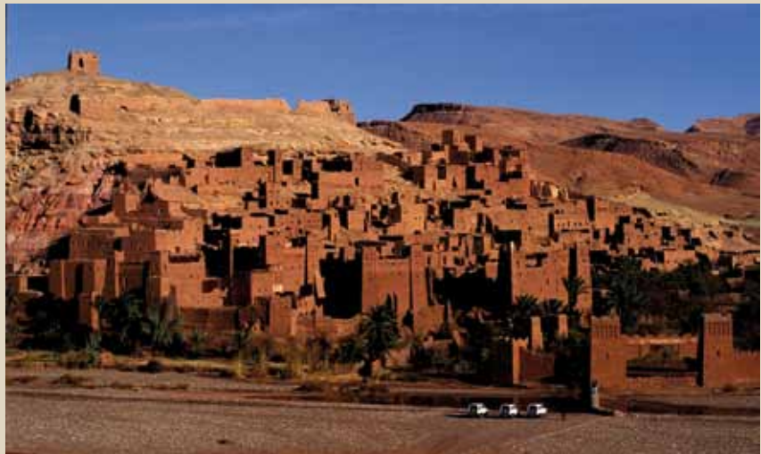
The Kasbah of Ait Ben Haddou

In the souk, henna, dates, roses, spices and sage stands beside Berber pottery, carved stone objects and Taznakht carpets. The craft center contains sculpture workshops and silk embroidery with flamboyant colors.