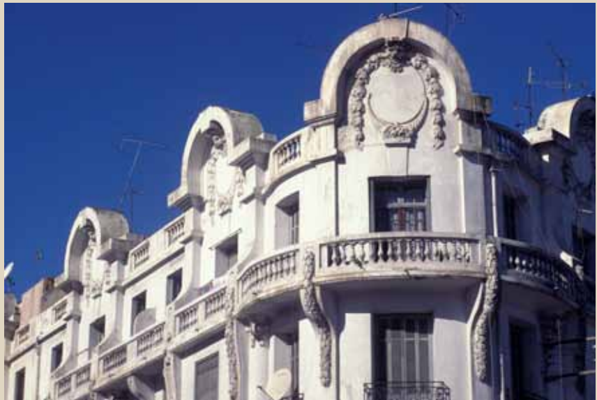
Casablanca Art Deco at its best

The Corniche of the city is a harmonious living space offering many activities: restaurants, ice cream stores, luxury hotels, shopping centers, playgrounds, shows, nightclubs, movie theaters, yacht clubs ... Soon the city will build a huge marina combining luxury hotels, luxury apartments, business center and shopping malls. An ambitious project designed to become a major tourist attraction, sealing forever the growth of the booming city.