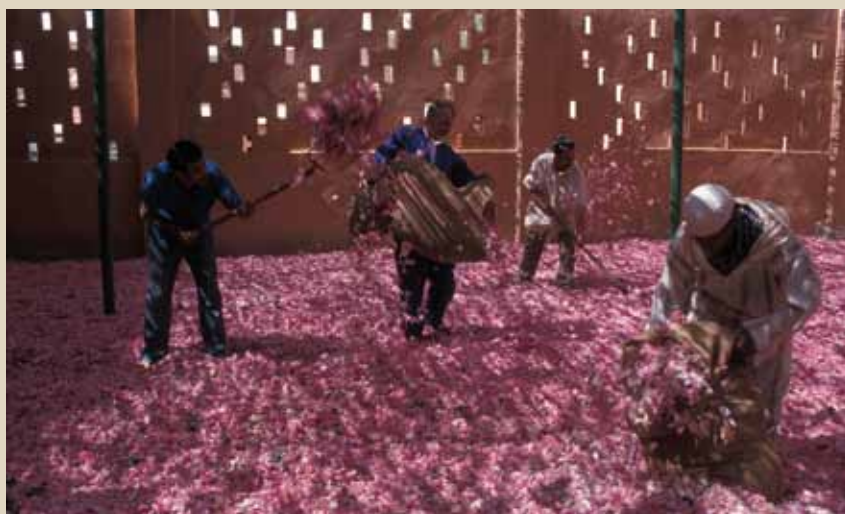
Picking roses in Kalaat Magouna

Famous throughout Morocco, the roses of the Kalaat M'gouna Valley are valued for their beauty and exceptional fragrance. They are picked up in May and it is the occasion of a big celebration, «The Moussem of Roses» in Kalaat M'gouna. The most fragrant one, the Rosa Damascena is cultivated in beautiful rose gardens and its rose water is a delicacy for the senses.